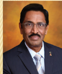
Datuk Seri Dr. Subramaniam, Minister of Health Malaysia