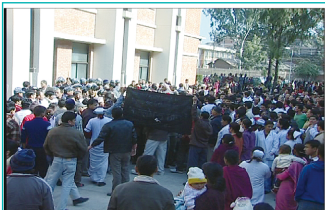
Picture 1. Protest against the perpetrators by the health professionals in Kanti Children Hospital Kathmandu, Nepal. 11 September 2011