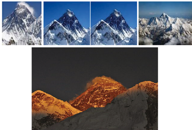
Morning view of Mount Everest