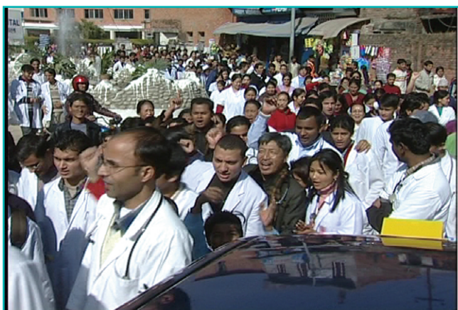
Picture 3. A protest rally organized by health professionals in Tribhuvan University Teaching Hospital, Kathmandu Nepal. 31 March 2010