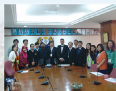
Malaysian Medical Association