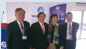
Venue of WHA & WMA Assembly