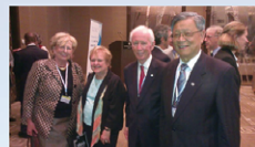
American Medical Association