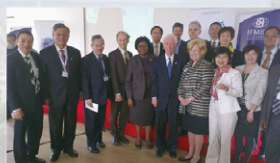
Venue of WMA Luncheon Meeting