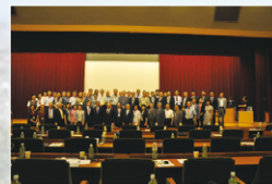
Japan Medical Association