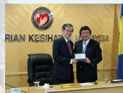
Malaysian Medical Association