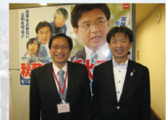
Japanese Ministry of Health