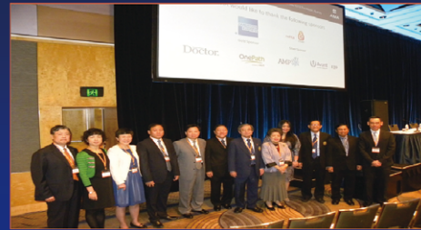
May 24-26, 2013