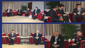
Jan 26-28, 2013