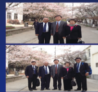
March 21-24, 2013