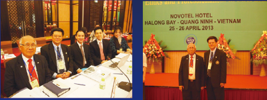
Halong: April 25-26, 2013